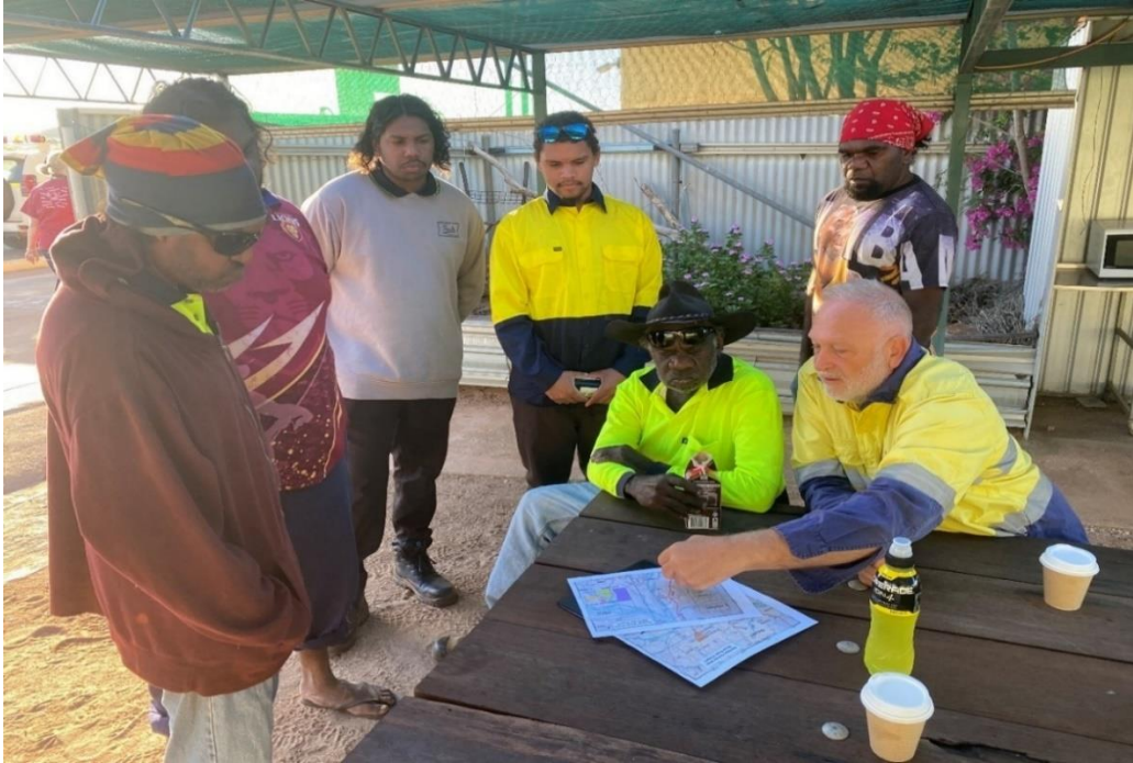
Photo 3 – Nyamal Corporation Traditioned Landowners with MinRex Staff completing Heritage Survey

This ASX announcement has been authorised for release by the Board of MinRex Resources Limited.