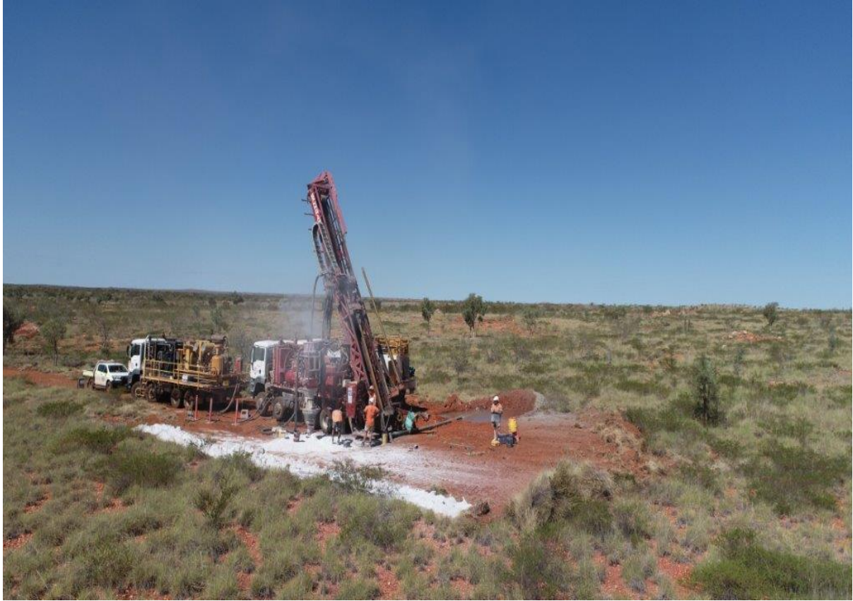
Photo 1 – FORACO Reverse Circulation Drill Rig at Shaw River historic Tin Tantalum Mine